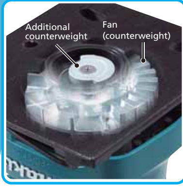
Low Vibration: 3.1m/s<sup>2</sup> (loaded)* Dual counterweight balancing system for reduced vibration.